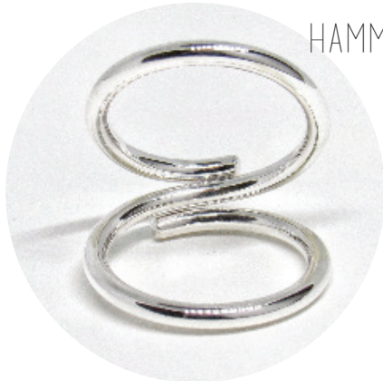
WIRE ADJUSTABLE SWAN SPLINT RING IN STERLING SILVER Price: $25 US dollars