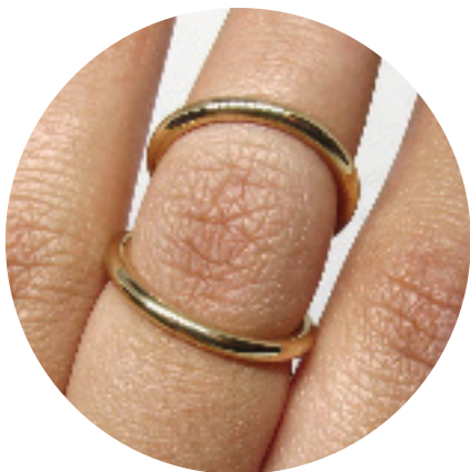
14K YELLOW GOLD FILL ADJUSTABLE SWAN SPLINT RING Price: 49 US dollars