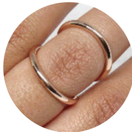
14K ROSE GOLD FILL ADJUSTABLE SWAN SPLINT RING Price: 49 US dollars