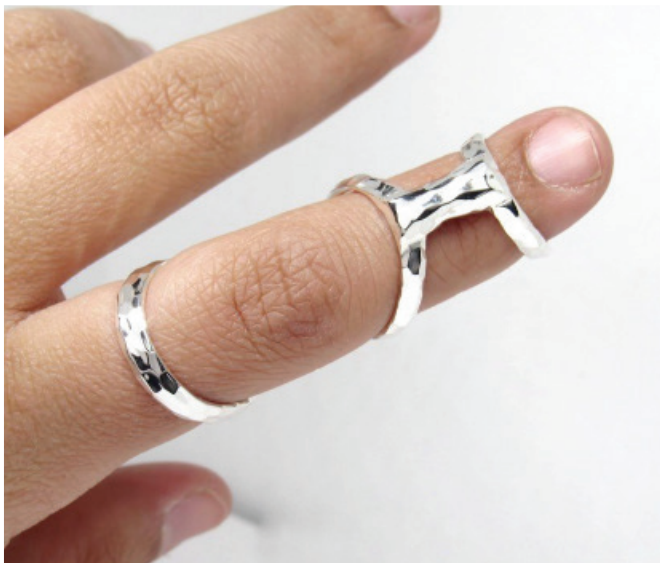
Hammered Style Combination Ring