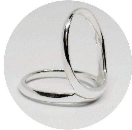
ULTIMATE SWAN SPLINT RING IN STERLING SILVER Slightly thinner than the standard swan splint version, equally supportive Price: $38 US dollars