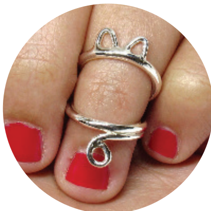
CAT ADJUSTABLE SWAN SPLINT RING IN STERLING SILVER Price: $34 US dollars