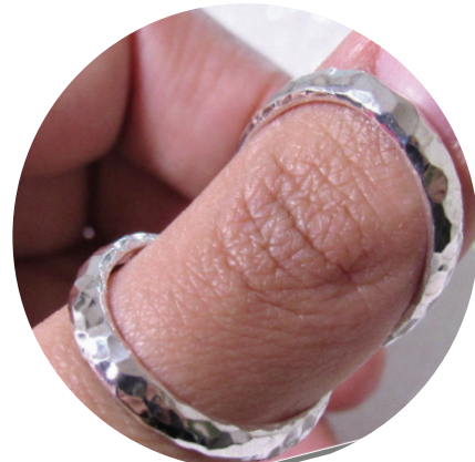
HAMMERED SWAN SPLINT RING IN STERLING SILVER Price: $39 US dollars