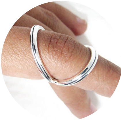
OZIDIZED LINE SWAN SPLINT RING IN STERLING SILVER Price: $38 US dollars