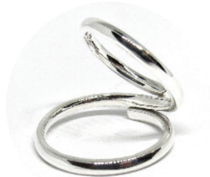
ADJUSTABLE SWAN SPLINT RING IN STERLING SILVER Price: $29 US dollars