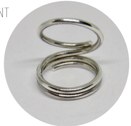
DOUBLE SUPPORT ADJUSTABLE SWAN SPLINT RING IN STERLING SILVER Price: $28 US dollars