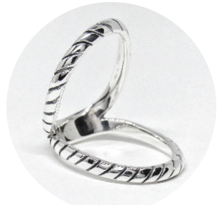
ZEBRA STYLE SWAN SPLINT RING IN STERLING SILVER Price: $40 US dollars