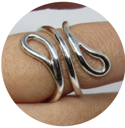
DROP BOUTONNIERE SPLINT RING IN STERLING SILVER