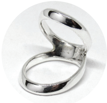
WIDE BAND SWAN SPLINT RING IN STERLING SILVER Price: $39 US dollars