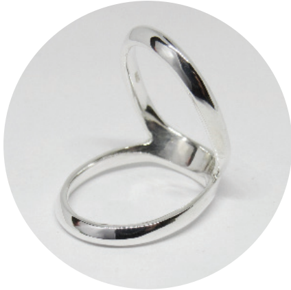
STANDARD SWAN SPLINT RING IN STERLING SILVER Price: $38 US dollars

Recommended to use for moderate hyperextension; less than 20 degrees. Used on PIP, DIP or thumb IP joint.