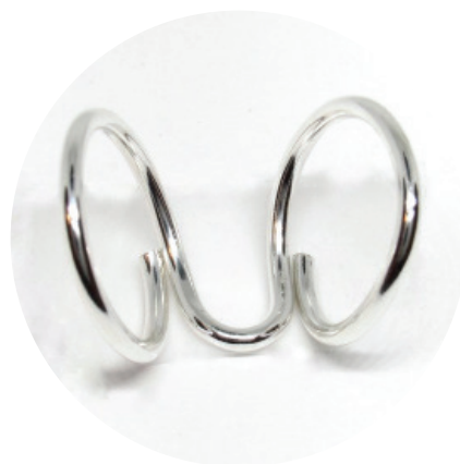
ADJUSTABLE BOUTTONNIERE SPLINT RING IN STERLING SILVER