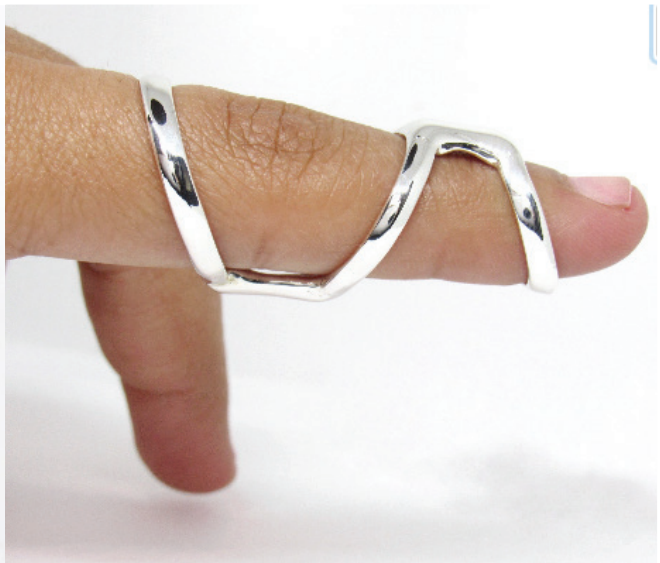
Polished Style Combination Ring also available in MATTE style

Beautiful Combination Silver Splint Rings will limit hyperextension of one joint with limiting flexion of the other