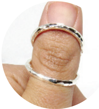
HAMMERED ADJUSTABLE SWAN SPLINT RING IN STERLING SILVER Price: $33 US dollars