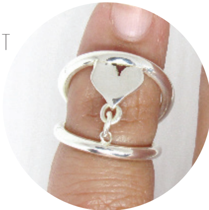
HEART ADJUSTABLE SWAN SPLINT RING IN STERLING SILVER Price: $35 US dollars