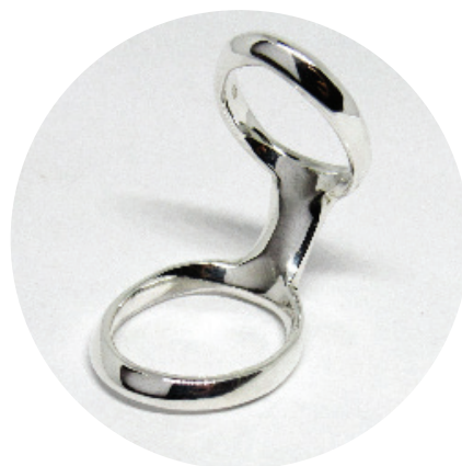
BOUTTONNIERE SPLINT RING IN STERLING SILVER