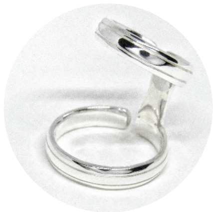
ADJUSTABLE BOUTTONNIERE SPLINT RING IN STERLING SILVER