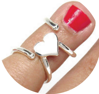
HEART BOUTONNIERE SPLINT RING IN STERLING SILVER