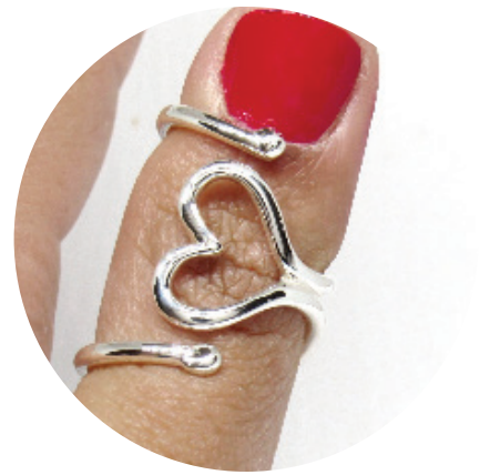
HEART TRIGGER SPLINT RING IN STERLING SILVER