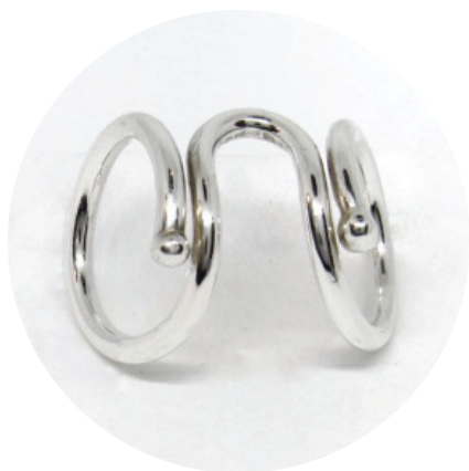
ADJUSTABLE BOUTTONNIERE SPLINT RING IN STERLING SILVER